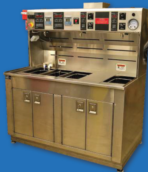
Wet Process Stations