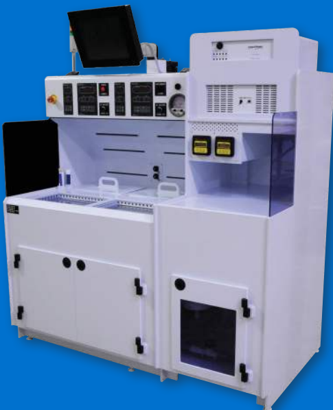
Lip-exhausted Process Stations