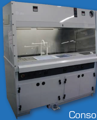
Console Fume Hoods